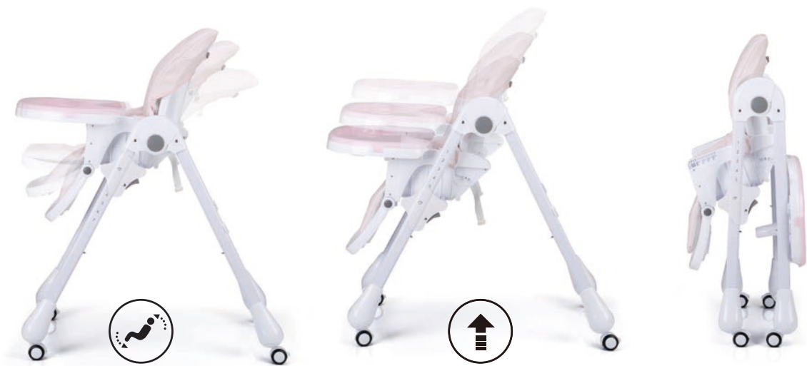
3 position reclining seat backrest