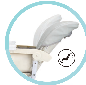
2 position reclining seat backrest

20'GP: 474 pcs 40'GP: 968 pcs 40'HQ: 1098 pcs