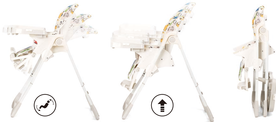
3 position reclining seat backrest