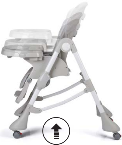
7 height positionest