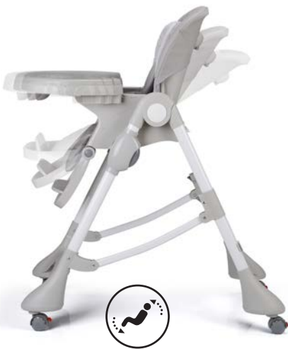
3 position reclining seat backrest