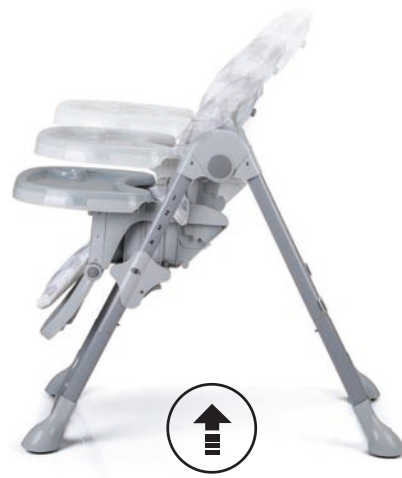
6 height positionest