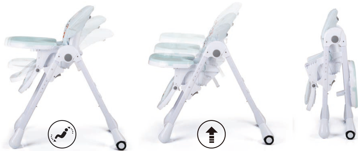
3 position reclining seat backrest