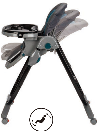
3 position reclining seat backrest