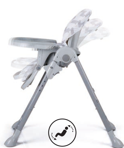
3 position reclining seat backrest