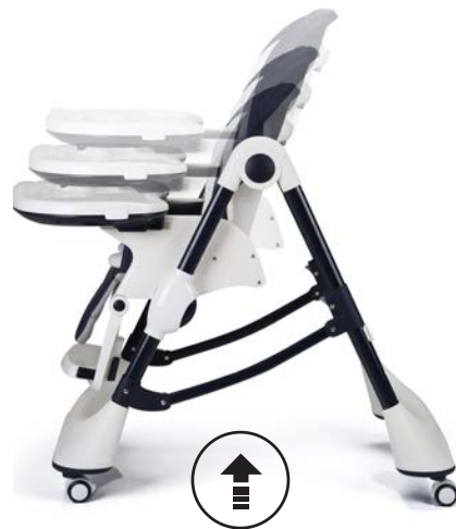
7 height positionest