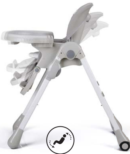
3 position reclining seat backrest