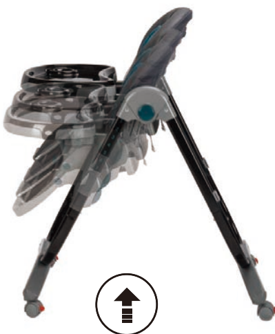
7 height positionest