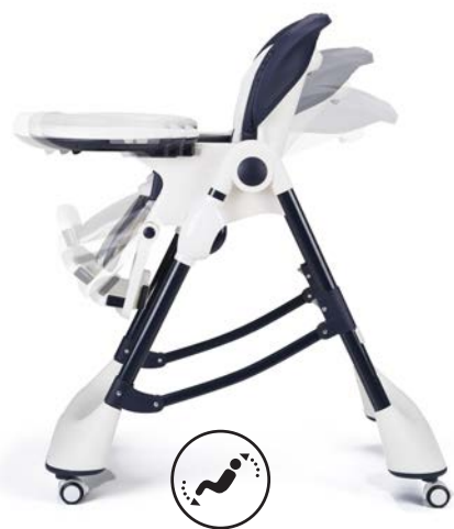
3 position reclining seat backrest