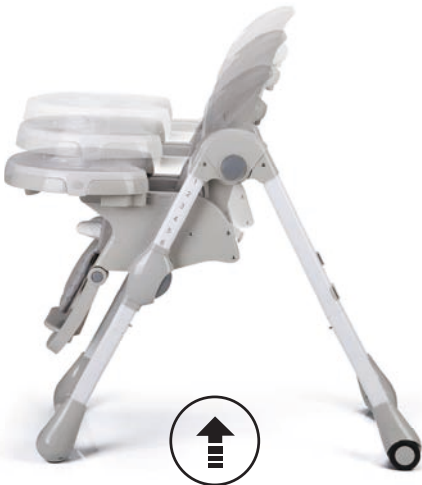
6 height positionest